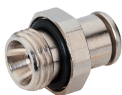
Straight Fittings - Quick Connect Style